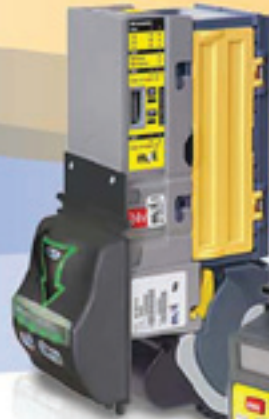
CASHFLOW VNR: Note Recycler