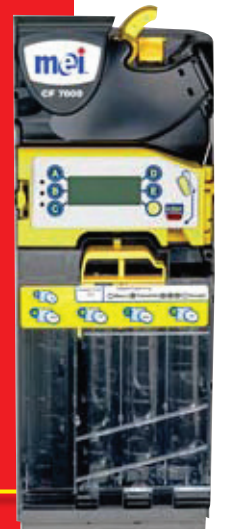
PHOTO COPIER COIN BOXES, TIMING COIN BOXES

Methodical Services can provide a comprehensive range of specialised equipment for the operating of coin/note/token and card systems, as well as installation and service. Approved distributor for MEI®