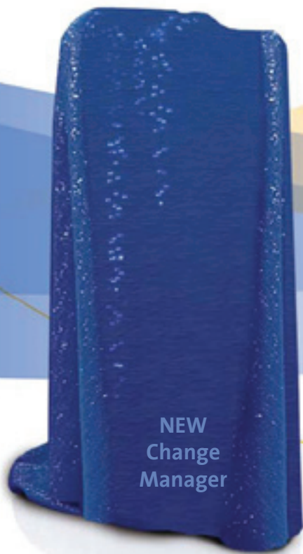
NEW Change Manager