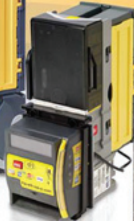
CASHFLOW: 4-in-1 Validator Cashless Reader