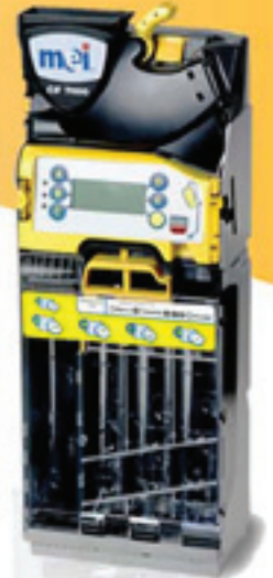
CF7000: Change Manager