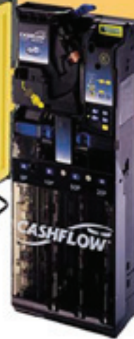
CF690: Change giver